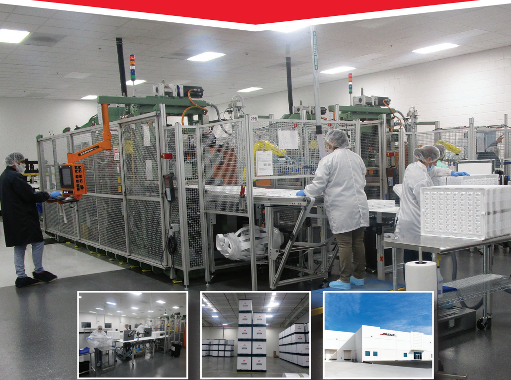
Pictured above, left to right, are Prent employees working in the Class 8 cleanroom, Prent's returnable totes, and the Prent Baja facility in Playas de Rosarito, B.C.